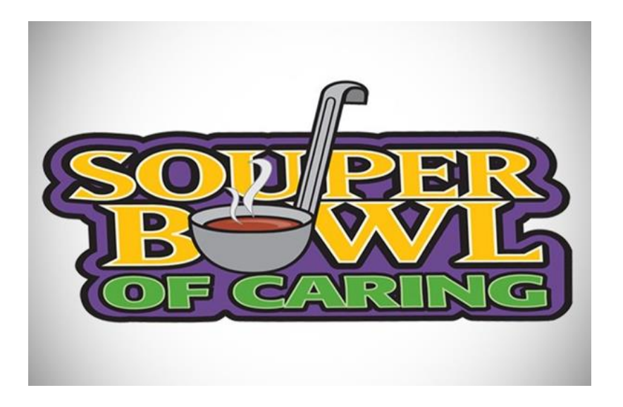
First Congregational Church will be participating in "Souper" Bowl Sunday this year.

We are asking everyone to bring cans of soup (please check the expiration dates) to church on Sunday, February 11th for our food pantry. This is a great way to participate and help fill our food cupboard with nourishing and warming soup. There is nothing like a nice cup of warm soup on a cold day. Good for the soul and good for the body. If you can't make it to church on Sunday February 11<sup>th</sup> you can drop off your donations at the side entrance of the church at any time. Thank you for participating in this very worthy cause.