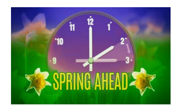
Daylight Saving Time Starts

Sunday, March 13, 2022 at 2:00 am clocks are turned forward 1 hour ahead.